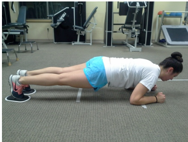
PB ROLL OUT